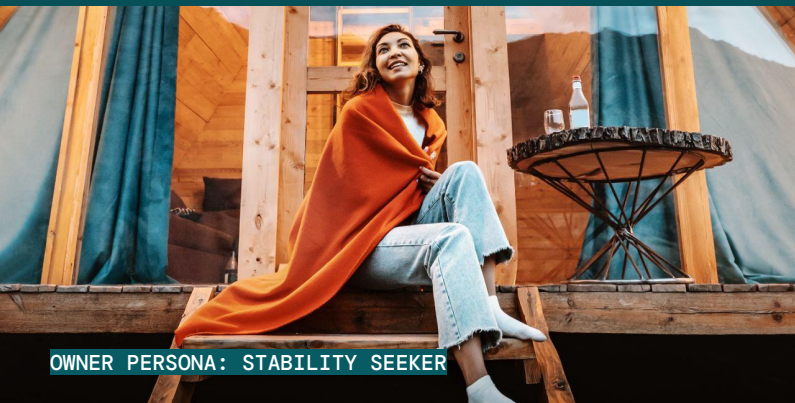
OWNER PERSONA: STABILITY SEEKER